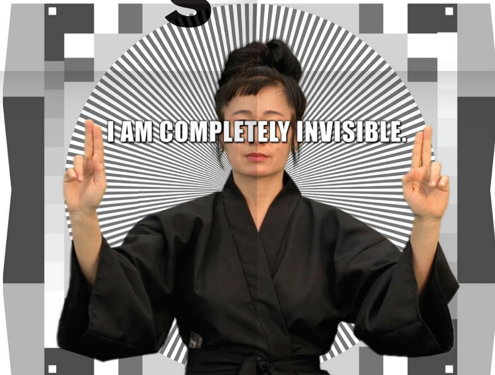
Hito Steyerl, How Not To Be Seen. A Fucking Didactic Educational .MOV File , 2013. HD video file, single screen, 14min.