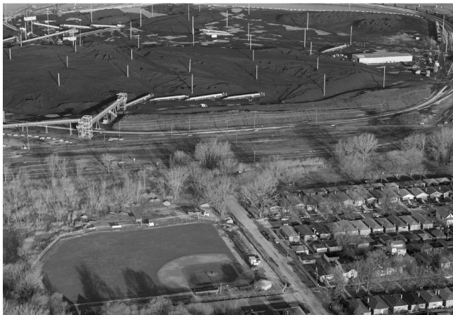
Terry Evans, Koch Brothers Petcoke Pile Near the Neighborhood , 2015.